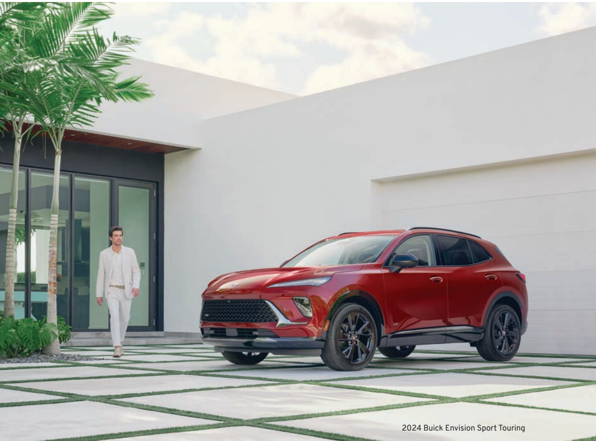
2024 Buick Envision Sport Touring