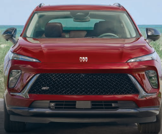
2024 Buick Envision Sport Touring