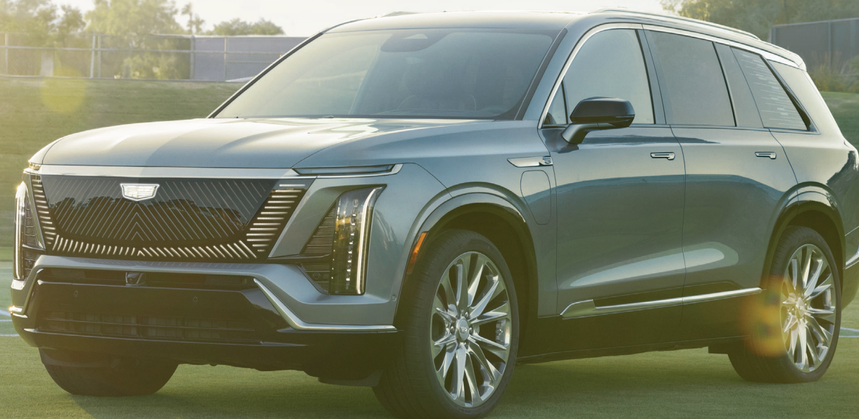
2026 Cadillac VISTIQ Premium Luxury

Scan the QR code to learn more about the 2026 Cadillac VISTIQ.