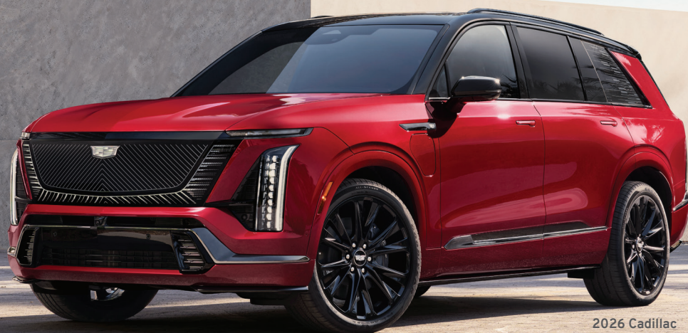
2026 Cadillac VISTIQ Platinum

The spacious, well-appointed latest addition to Cadillac's EV lineup presents a range of benefits rivaling what competitive EV vehicles can now achieve out on the road. Here are just some of the advantages the VISTIQ offers owners.